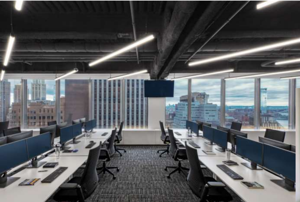
PHYSICAL OFFICE SPACE