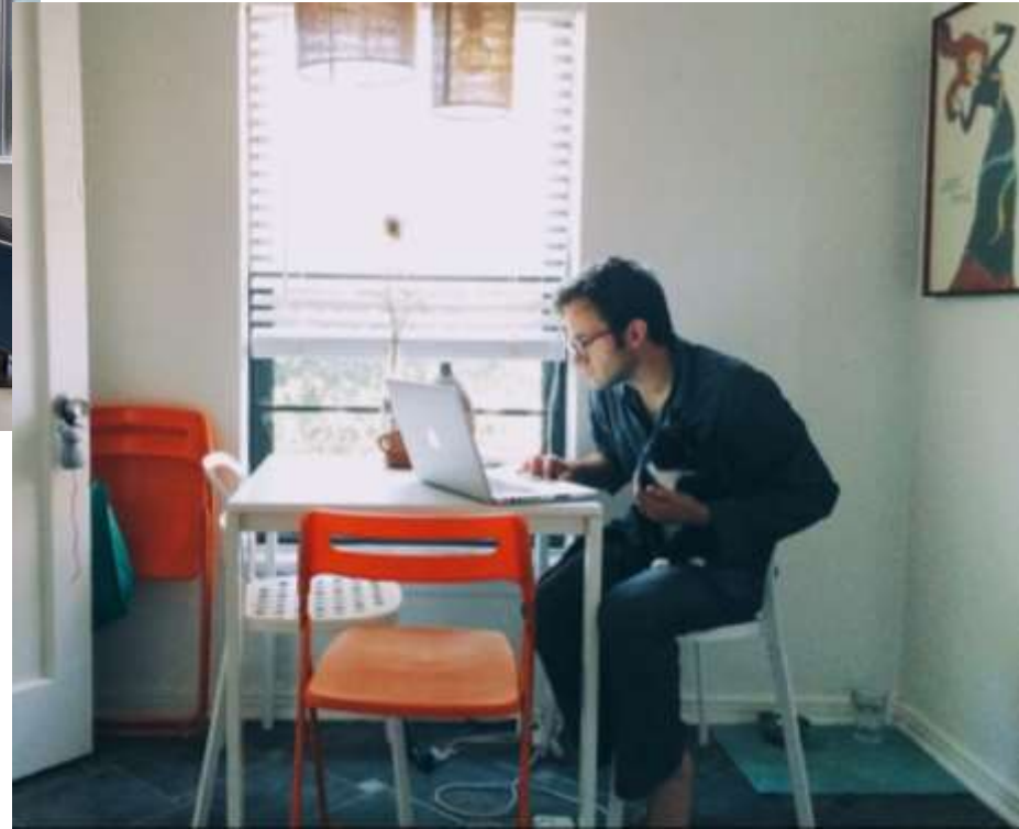
HOME OFFICE PLACE