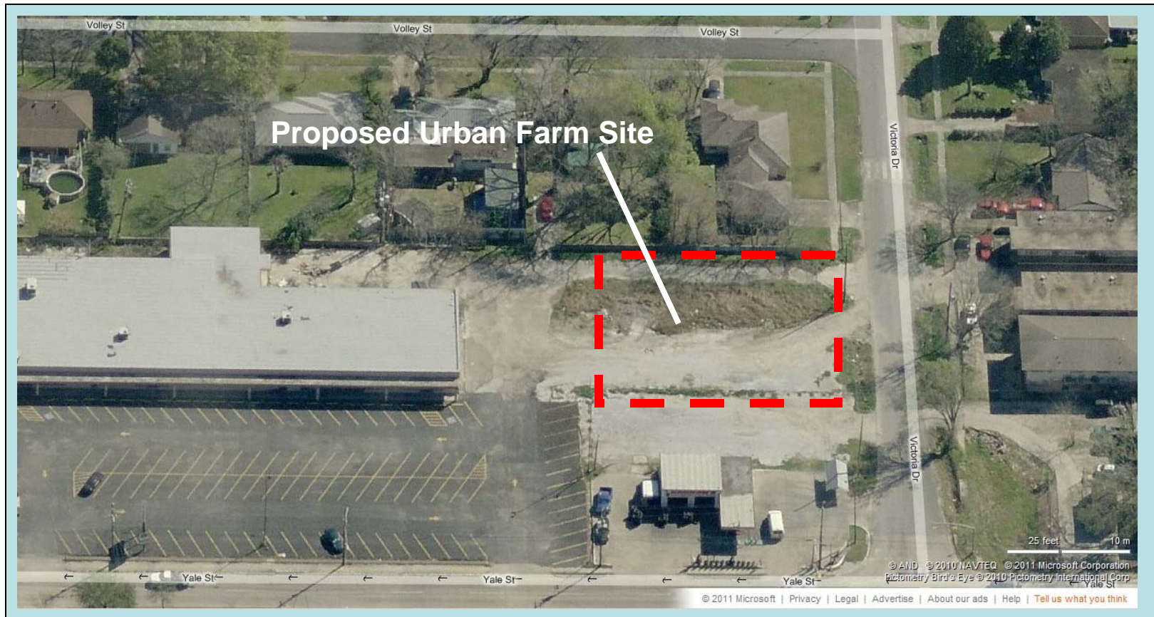
Aerial View of VOA Yale St. Facility