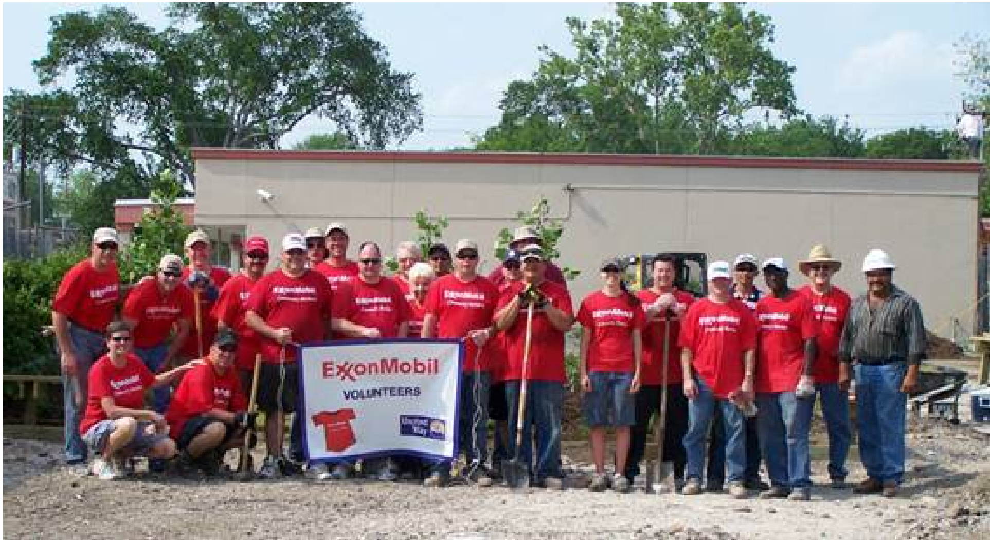
ExxonMobil and JE Dunn United Way Day of Caring – April 20, 2011